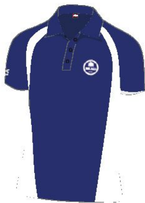
Boys house coloured polo shirt

Gum Shields are required for Rugby and Hockey