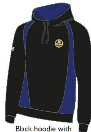
Black hoodie with House colour trim (optional for boys)