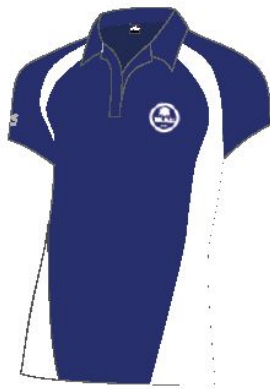
Girls house coloured polo shirt