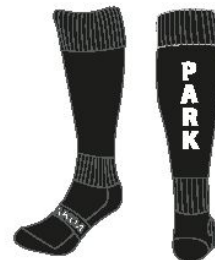
Long black socks